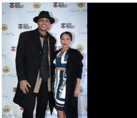
CARMELO AND LALA ANTHONY

Though an injured left knee prematurely ended New